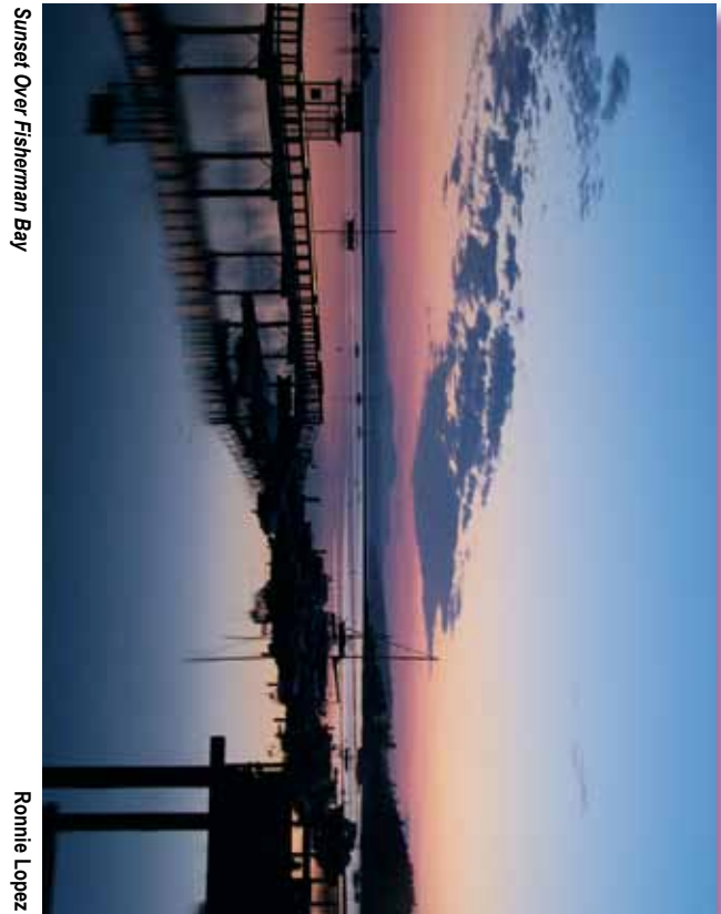
Sunset Over Fisherman Bay