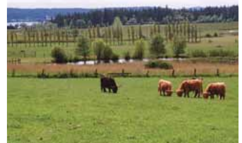
Highland Valley View Delores Foss

When planning a trip to Lopez, remember to dress casually. The weather typically is warm in the summer, with an average high temperature of 72, and wet in the winter with highs in the 40s-50s. Average yearly rainfall is between 19-25 inches—about half of that in the neighboring Seattle area. We see an occasional snow shower in the winter but it never lasts long. Spring and Fall can be warm, cold, wet or dry...or just about anything in between! It's best to layer clothing and always have a lightweight jacket or sweatshirt handy.